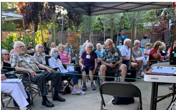
Left: Welcome back meeting of CVGC

For September we will have our 1st Progressive CVGC Member Garden Tour where we will visit one member's vegetable garden and share various appetizers, next stop will be at a member's beautiful garden with running creek bed and pond within an aviary her son built to raise his exotic ducks while enjoying finger foods. The last stop will be at a member's hillside home with views of the entire valley showing Walnut Creek, Pleasant Hill, Concord, Martinez, and across the Carquinez Strait with dessert and wine during a beautiful sunset.