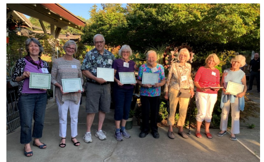
Right: Recognition For CVGC members with over 20 years of service